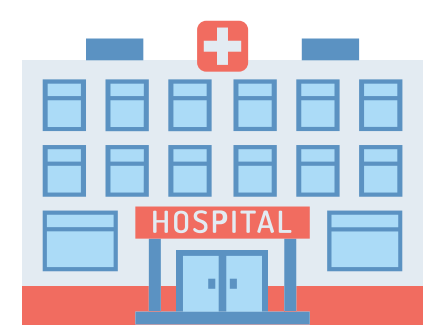
1 in 5 people will be hospitalized